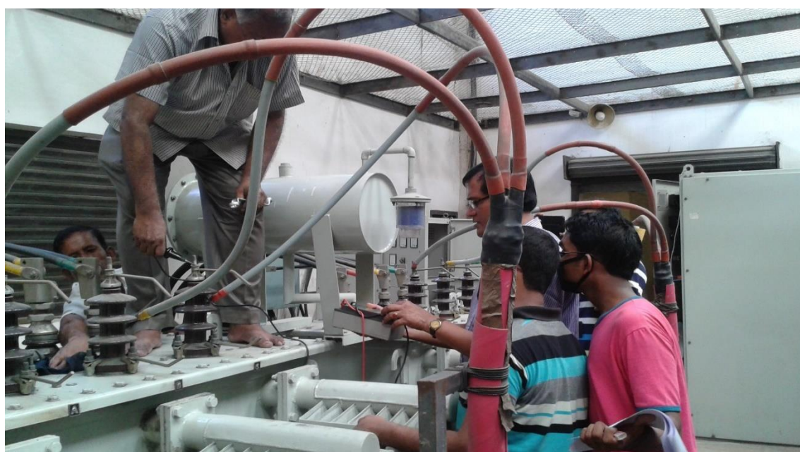
Electrical Inspection Service At HKD International, CEPZ, Chattogram