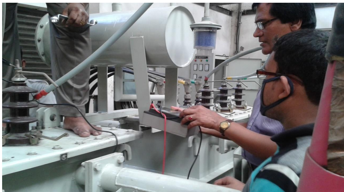
Electrical Inspection Service At HKD International, CEPZ, Chattogram

Investigation/survey of electrical incidence, fire, etc.