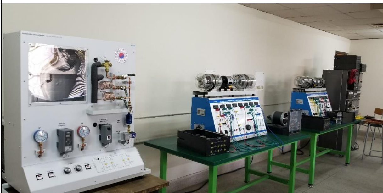
4.1 ► Electrical Demonstration Lab