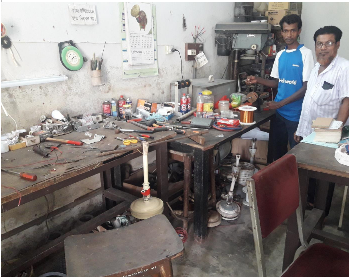
4.7 ► Electrical Winding & Maintenance shop