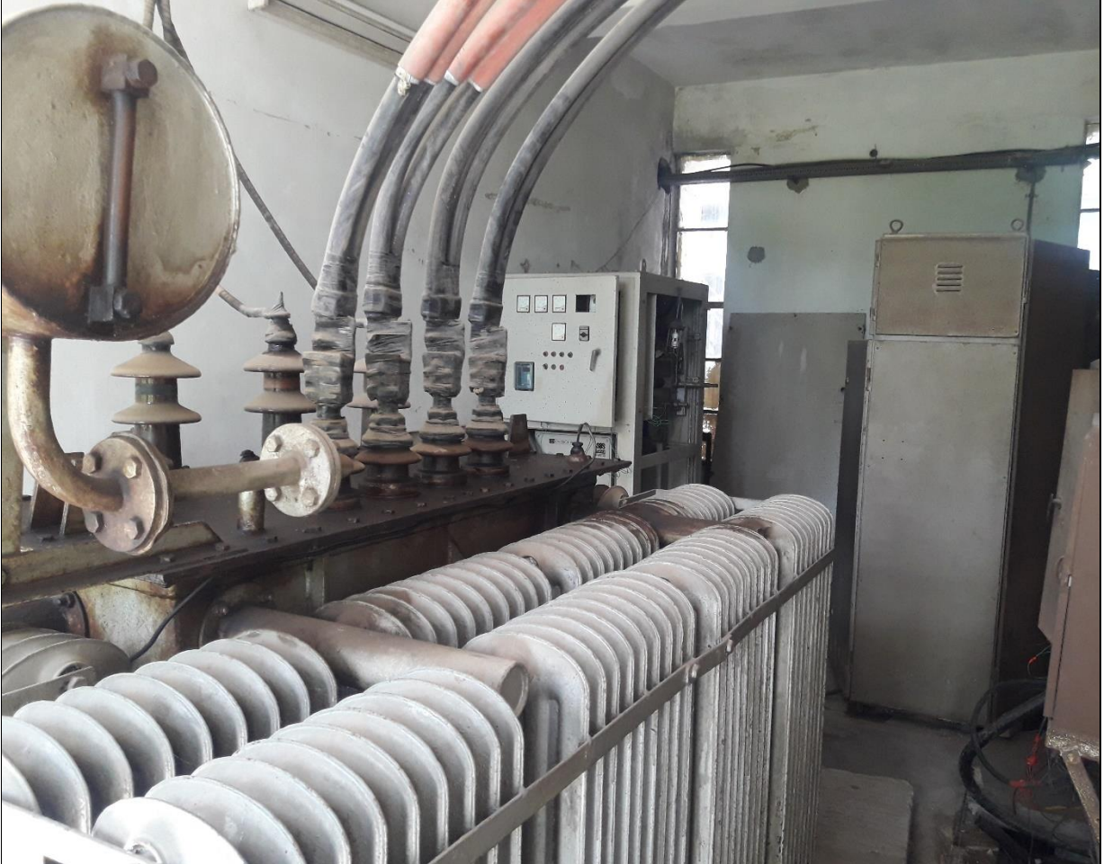
4.8 ► Electrical Substation