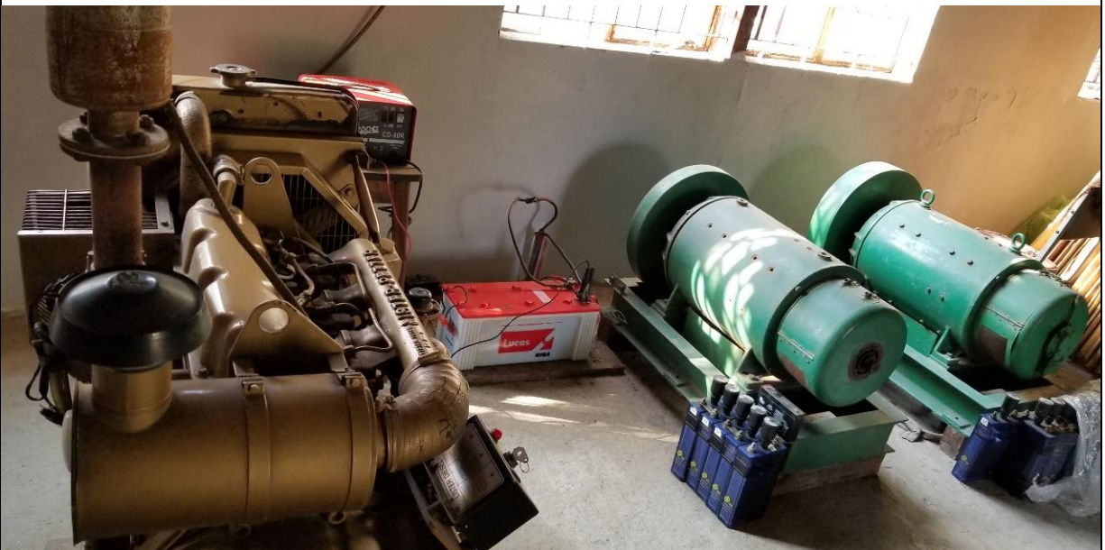
4.6 ► Power Generation & Distribution Lab